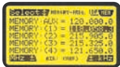
Frequency memory page