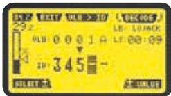
LoJack ID for selective filter