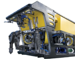
Applications: ROV/AUV, Diver