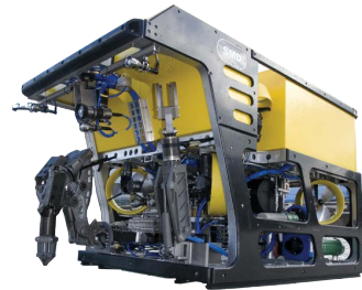
Applications: ROV/AUV, Diver